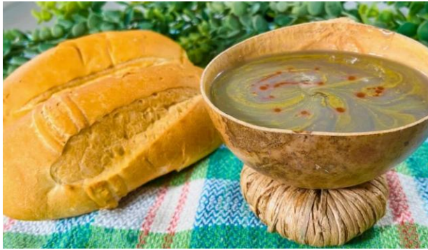
Fresco de Chan