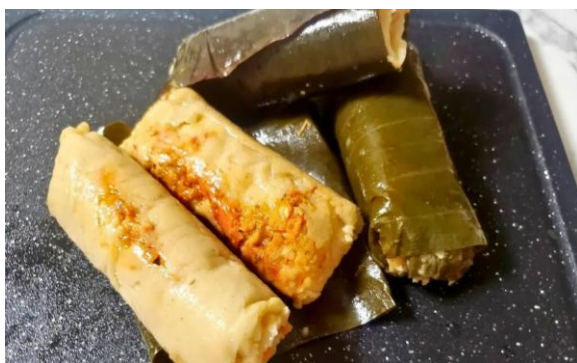
Panes con Pollo Salvadoreños