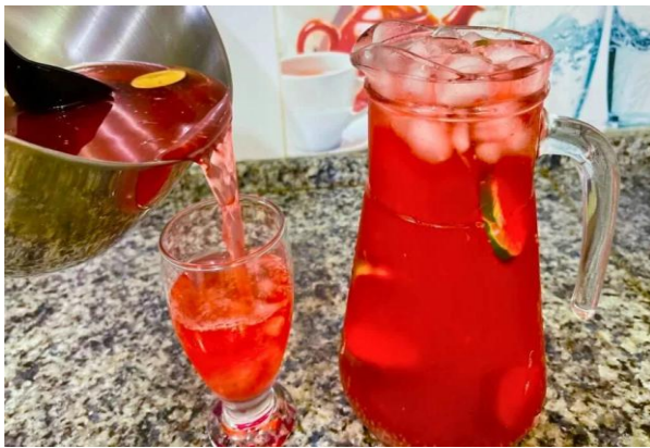
Atol de Piña